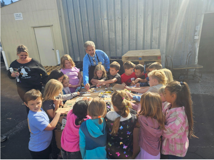
1st grade Community trip to Larkfield