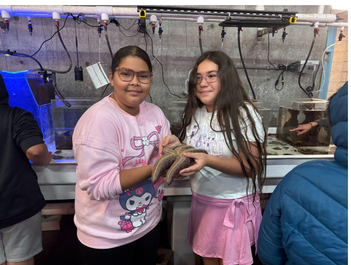
5th graders at the Bodega Bay Lab