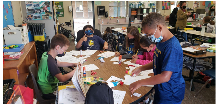
5th graders working on Native American Project