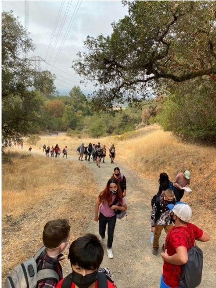
6th graders on Shiloh Park hike