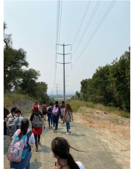
6th graders on Riverfront Park field trip