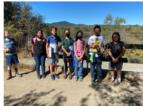
5th graders listening to a water conservation presentation from the Sonoma County Water Agency