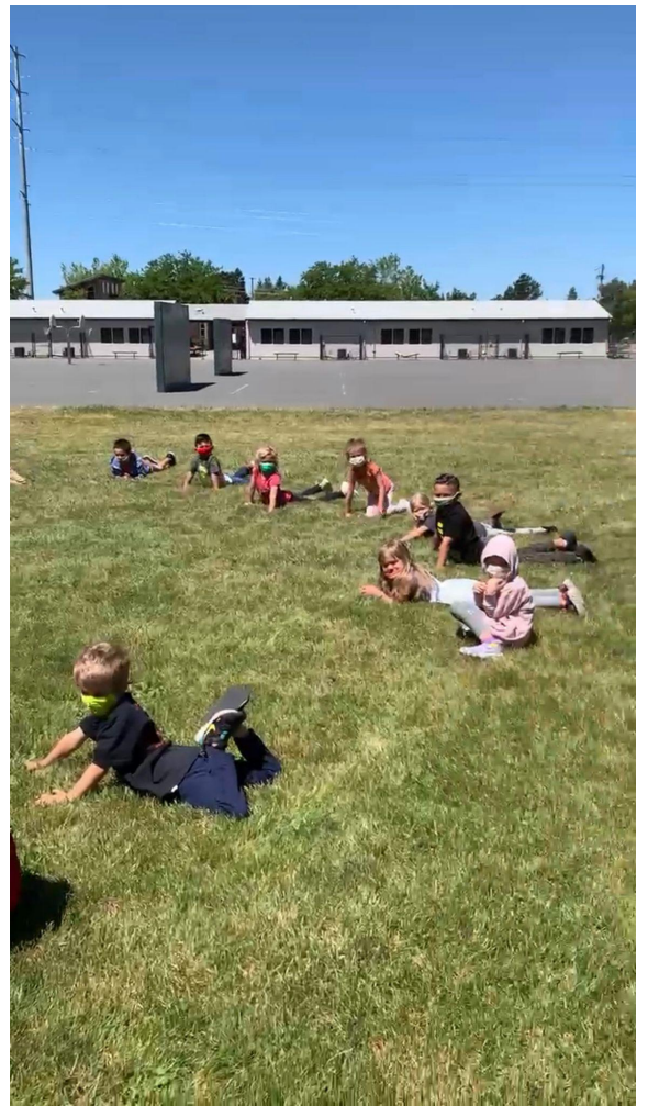
Kindergarten releasing their butterflies