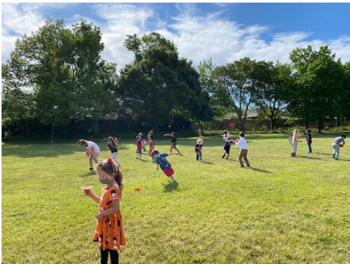
Kindergarten launching Ladybug Flyers